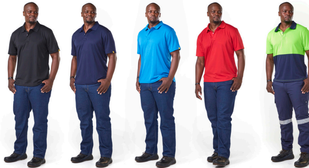
DW-TECH-GBK DW-TECH-GNB DW-TECH-GRB DW-TECH-GRD DW-HVTECH-GLNB

Style: Short sleeve collared shirt with two button closure Fabric composition: 100% Polyester Mass: 140gsm