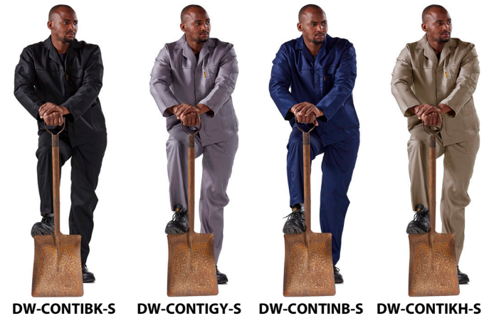
DW-CONTIBK-S DW-CONTIGY-S DW-CONTINB-S DW-CONTIKH-S

Style: Long sleeve jacket and pants suit. Fabric composition: 80% Polyester 20% Cotton. Mass: 200gsm.