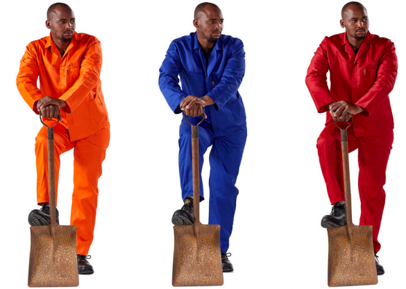
DW-CONTIOR-S DW-CONTIRB-S DW-CONTIRD-S